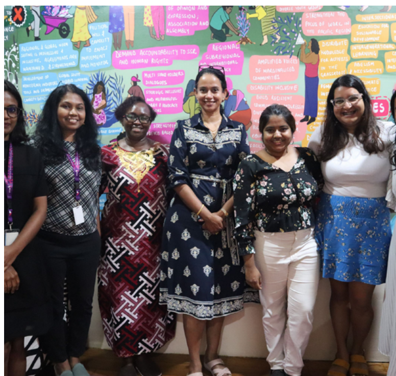
Malaysia partner visit, Orchid Project 2022.

Orchid Project remains hopeful that we can contribute to the end of the practice globally – but we must act now.