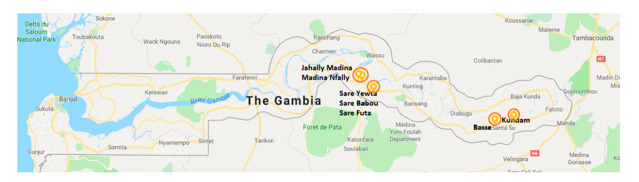
Figure 2. The areas of The Gambia where field work has been carried out.

The analysis unit is based on migration and the transfer of knowledge between family members residing in different countries, while the observation unit is made up of immigrant communities and second generations in Spain coming from African countries where FGM/C is practiced and who reside in Catalonia. In The Gambia, field work was carried out in communities which had family members abroad, from villages in Central River Region (CRR)—Jahally Madina, Madina N'fally, Sare Babou, Sare Futa, and Sare Yewta—and Upper River Region (URR)—Basse, Kundam Mafatty, and Kundam Demba (see Figure 2).