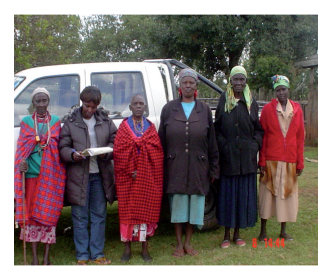
Fig. 2. — A group of women after a focus group discussion. Research assistant (second left).

A convenient sample consisting of 28 women was recruited from the area's general population. The sample was varied in terms of age (15 to 80 years), educational background (different levels of literacy), and vocation (housewives, farmers, traders, professional teachers, traditional birth attendants, traditional circumcisers, etc). Such variation was necessary to guarantee a more balanced perspective concerning the subject. A small number of men (19) were also selected with a view to access the male perspective regarding the same. Although most participants championed the right of the community to preserve the ritual and practice of FC, they were all exposed to the ongoing national discourses concerning FC and were indeed aware of the FGC eradication campaign. They thus had the benefit of insight from both sides of the ensuing cultural debate.