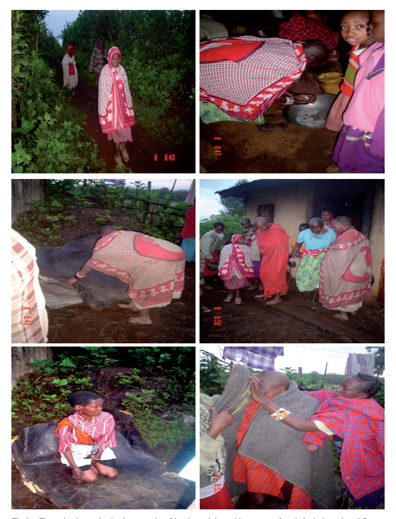
Fig. 4. — Time series pictures showing the progression of the witnessed circumcision ceremony from the beginning to the end.