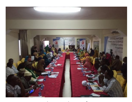
Attendees at the conference