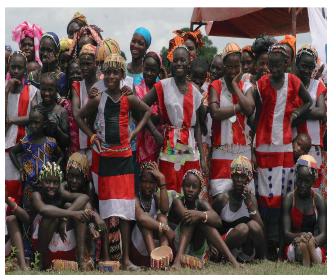
Kambura adolescents at the public declaration of abandonment of FGM/C Nemanding 2009

For example, the Joint Programme, the Executive Director of Tostan and representatives from the European network Euronet-FGM and the FGM Free Village Model, Egypt, participated in a panel on FGM/C entitled "Power to the Community" during The Girl Conference (9-10 March 2009) organized by the Government of the Netherlands. A common theme of all the presentations was the need for positive communication from within the affected communities, as evidence shows that prescriptive, judgemental messages and messages imposed from outside do not work. It was also agreed that putting an end to FGM/C is a process that requires long-term commitment and effort.