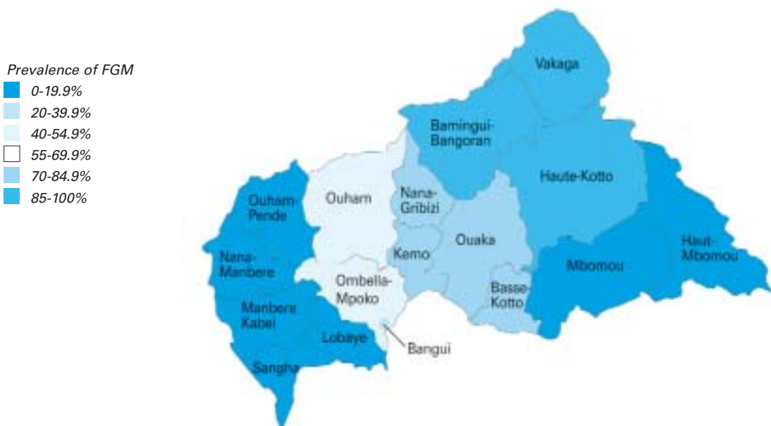
Map 2 - Central African Republic, 2000

The value of disaggregation by region or province is illustrated by the case of the Central African Republic (map 2), where data from MICS2 indicate that, at the national level, 36 per cent of women aged 15 to 49 have undergone FGM/C. Looking at the situation from a sub-national perspective reveals significant geographic variations. In five prefectures in the west of the country and two in the east, FGM/C prevalence